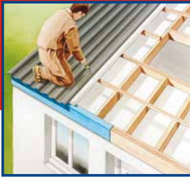
DURING - NEW ROOF BEING FITTED WITH INSULATION