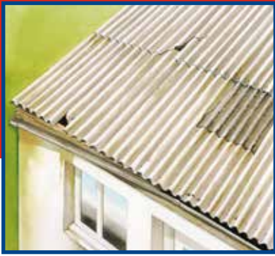
BEFORE - LEAKING