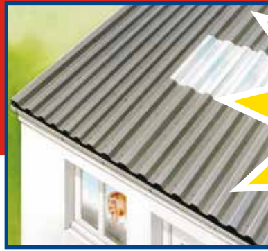
AFTER - SEALED, WARM & DRY